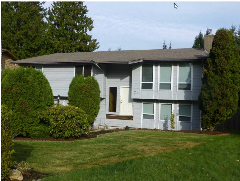
taken from N. 18 th Pl. looking northwest