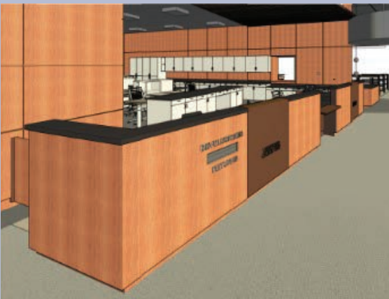
Stair railing detailing and coordination (above) and check-out cabinet detailing at