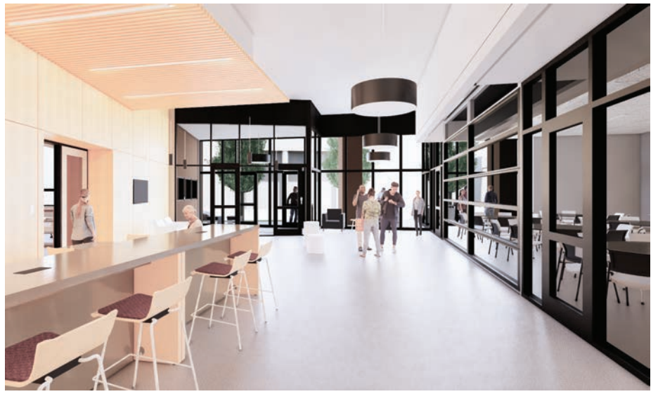
Updated renderings of the circulation corridor outside the Youth Services (left) and the Commons looking towards the north entry (right).