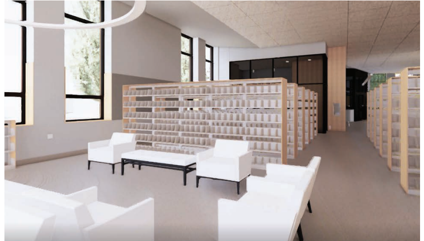
Updated rendering of the Quiet Reading area