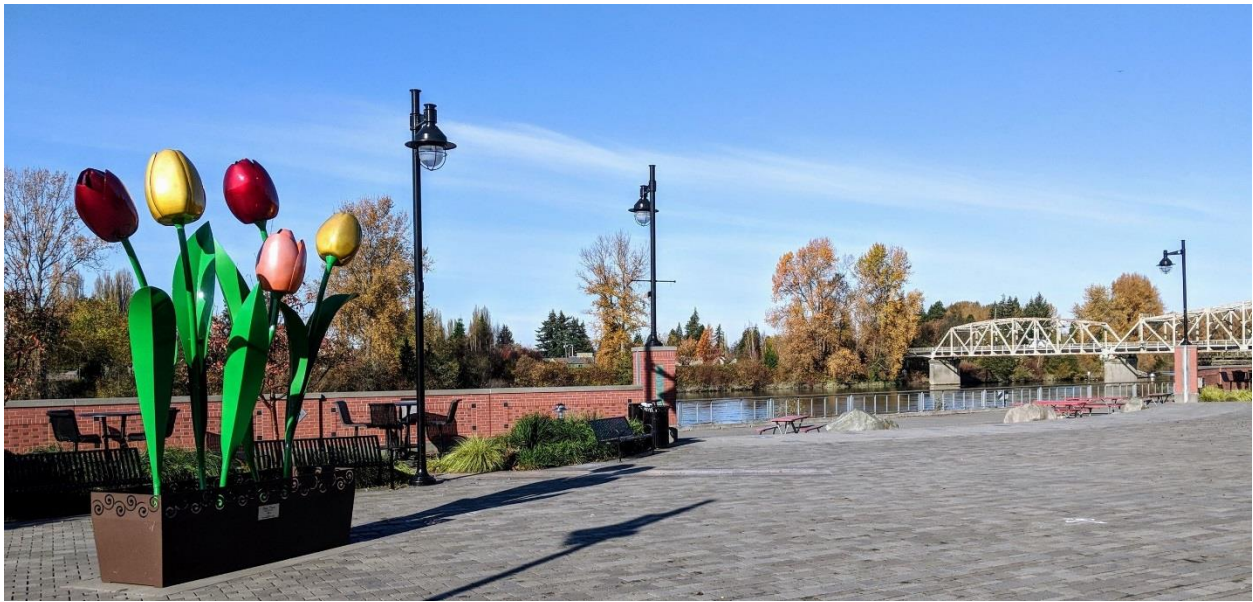
Riverwalk Plaza 2018